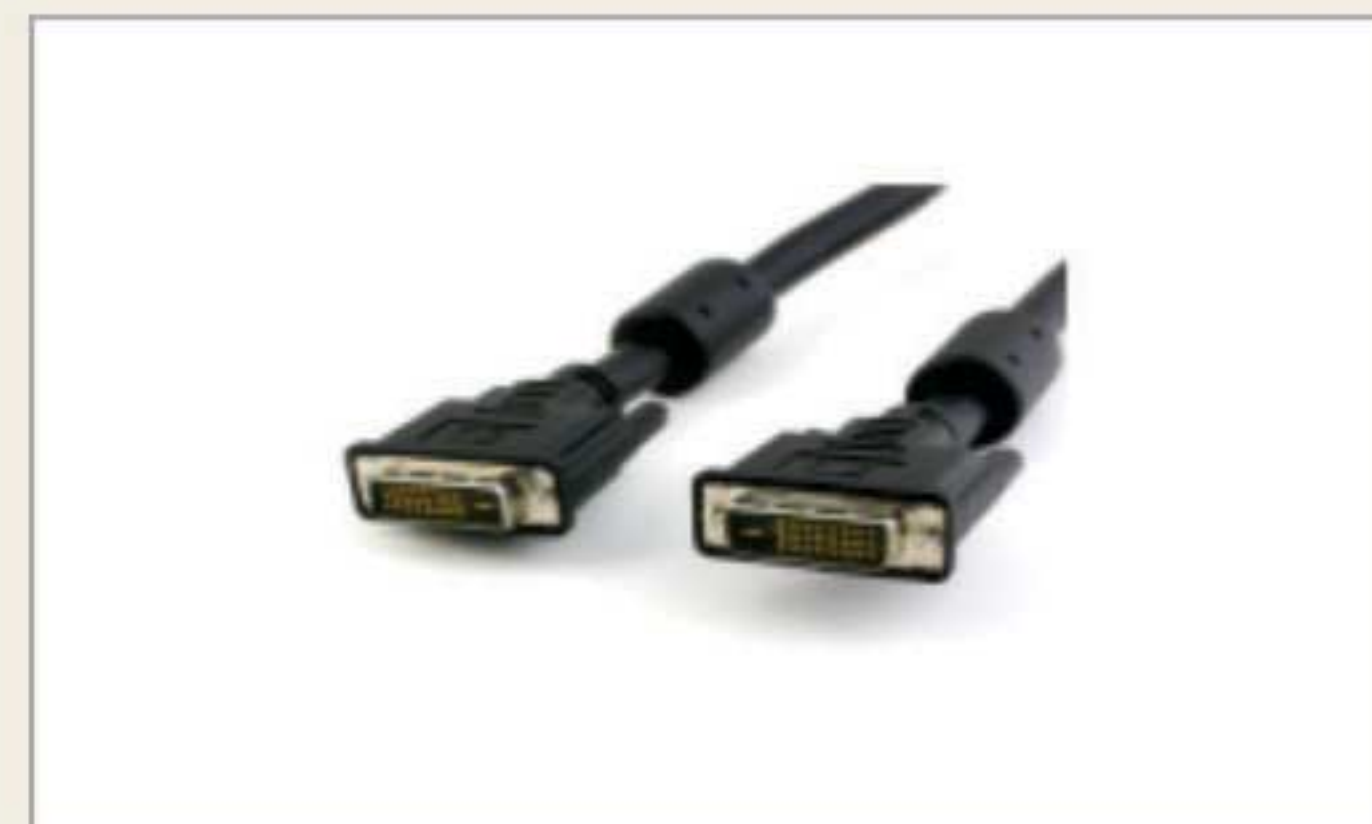
* HDMI-DVID cable