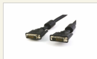
* HDMI-DVID cable